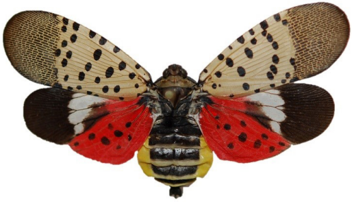
Spotted lanternfly.

Invasive diseases pose an equally significant threat. Soybean rust, for example, is potentially one of the most